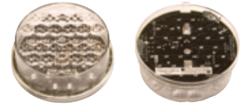
Optically enhanced LED Lamps

The 5", amber, PAR 46, LED lamp is a sophisticated, high-output, low-power-consumption, sealed-beam lamp with a life that is unparalleled by other conventional arrow board lamps. The lamp is backed by a five-year warranty.