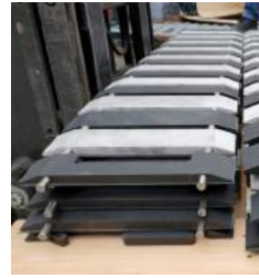
Neatly stacks for storage and transport, urethane bottom secures placement