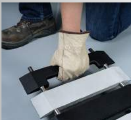
Easy Grip Handle