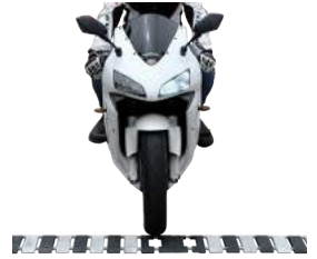
Safe with motorcycles