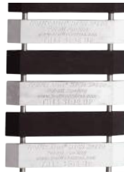
Contrasting color segments stand out on all road surfaces

Alerting Drivers with Sight, Sound and Sensation Awareness