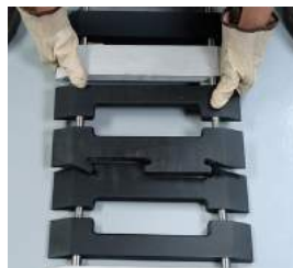
Jigsaw Connection locks firmly in place keeping Strips securely connected