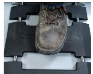
Jigsaw Connection locks firmly in place keeping Strips securely connected