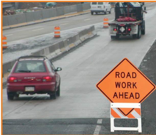
With the addition of a sign sleeve, the Plasticade barricade becomes a sign stand (NCHRP Certified)