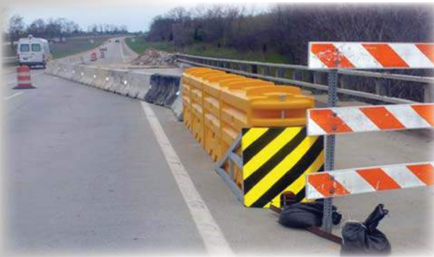
SLED™ TL-3 in use on a Missouri Highway