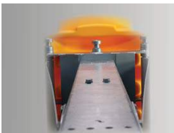
Steel Barrier Attachment