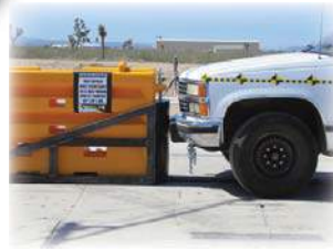
Inline TL-3 Truck Test Pre Impact