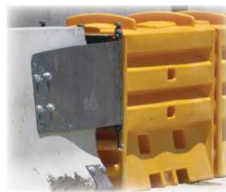
Concrete Barrier Attachment