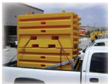
SLED™ TL-3 Transports in a Pick-Up Truck