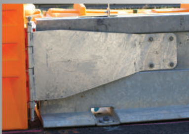
Steel Barrier Attachment