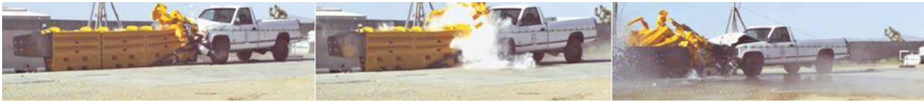
SLED™ TL-3 4500 lb. Pick-Up Truck Impact Attached to Concrete Median Barrier Wall

Each SLED module is manufactured from a high visibility yellow polyethylene that is UV stabilized to minimize degradation. It is designed to deform and rupture on impact, absorbing the energy of the errant vehicle. SLED has the most versatile transition for shielding all permanent and temporary portable barriers. The combination of hinging and contouring, allows the transition panels of the SLED End Treatment to be attached to narrow, wide or other profile shapes with either converging, or diverging angles, up to 10 degrees.