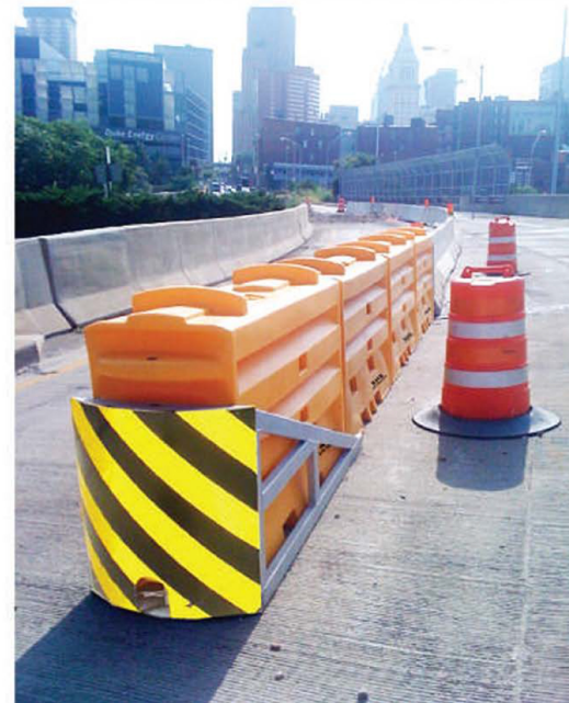
SLED™ TL-3 in Downtown Cincinnati, Ohio