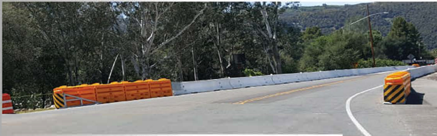
SLED™ TL-3 in use on a San Diego Roadway