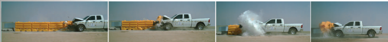
SLED™ TL-3 4900 lb. Pick-Up Truck Impact Attached to Concrete Median Barrier Wall

* Steel and plastic NCHRP 350 approved only.