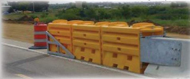
SLED™ TL-2 in Illinois