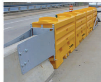
Concrete Barrier Attachment