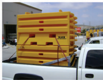
SLED™ TL-3 Transports in a Pick-Up Truck