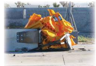
Inline TL-3 Truck Test Post Impact