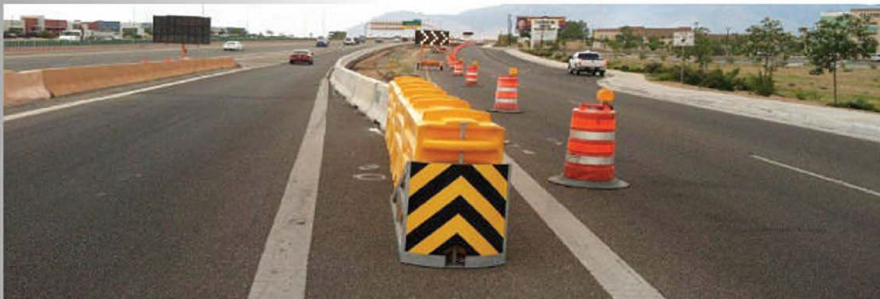
SLED™ TL-3 in New Mexico