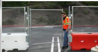
Secure entry with a 6' Single Gate