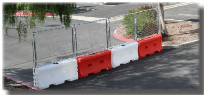
Ideal for vertical construction. Secure and easy to deploy.