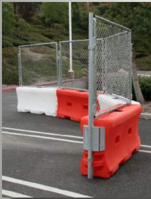
Water-Wall Fence Rotates up to 30° Degrees

The chain link fence will attach to the top of a longitudinal barrier, (TrafFix Water-Wall™), creating additional security to a work zone. The mesh fence will be made of 11 gauge steel, connected to vertical steel posts of 1 5/8" diameter. Fence sections will be 6' wide x 4' tall. Each fence section shall weigh no more than 42 lbs including the connector T-pin. Each T-pin will extend down through the sections of fence into the knuckles of the TrafFix Water-Wall to securely connect the fence to the wall. Each T-pin shall have a hole at the upper end for a security bolt to enhance security. The fence will accommodate a 6' single gate or a 12' double gate for entrance or exit from the work zone. For maximum stability, the TrafFix Water-Wall, filled with water will weigh 1,110 pounds. Overall height of the Water-Wall Fence attached to the top of the TrafFix Water-Wall will be a minimum 84".