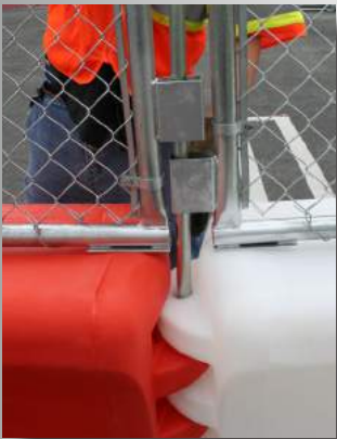
T-Pin Connects Wall to Wall and Fence to Fence