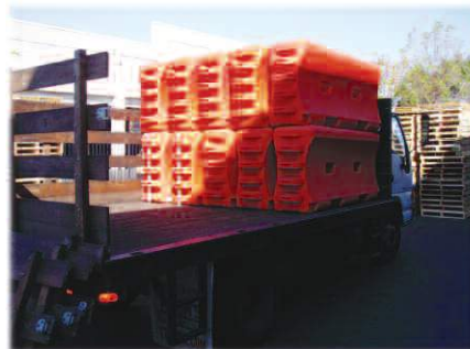
Water-Wall stacks for storage and transportation.