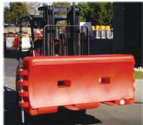
Water-Wall can be easily lifted and placed using a forklift or pallet jack.