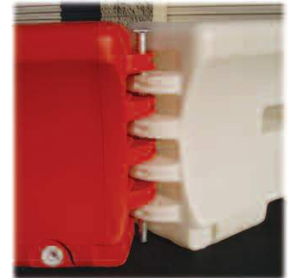
Water-Wall can pivot 30-degrees and be locked together with steel connection pins.