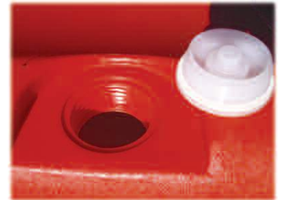
New tamper resistant, corner offset drain plug with coarse buttress thread — screws in or out in only 2 1/2 turns.